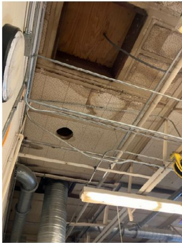
HS Roof 9 – TL-2