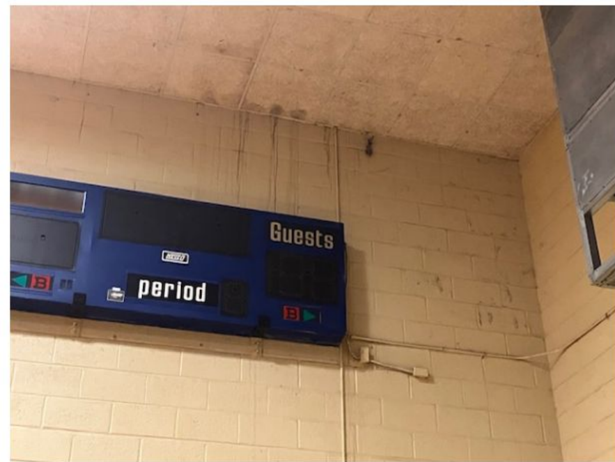
Intermediate Gym roof 19 Roof Leaks