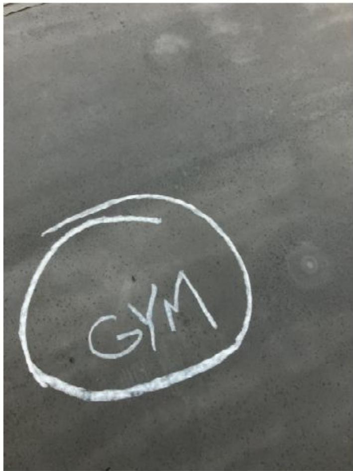
EPDM Roof Membrane Punctures