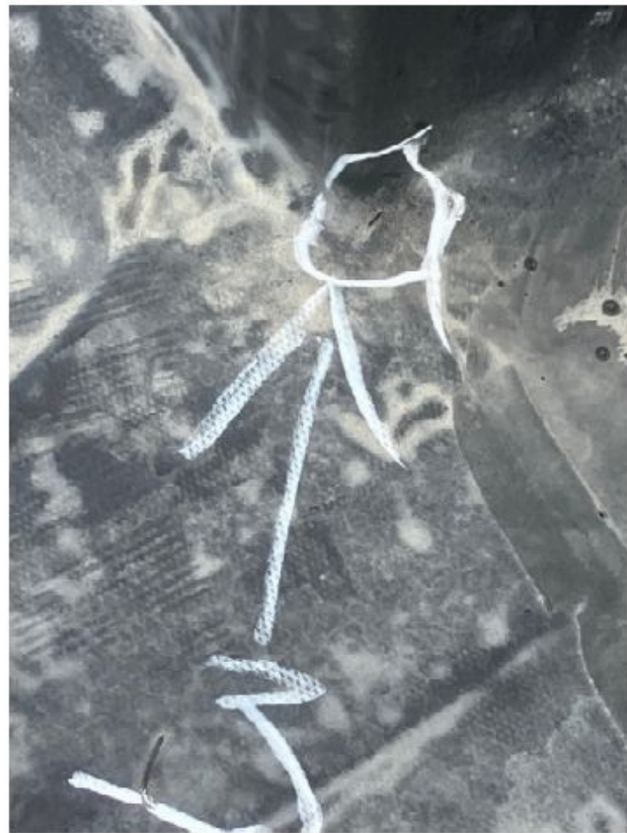
Roof Curb Flashing Failure