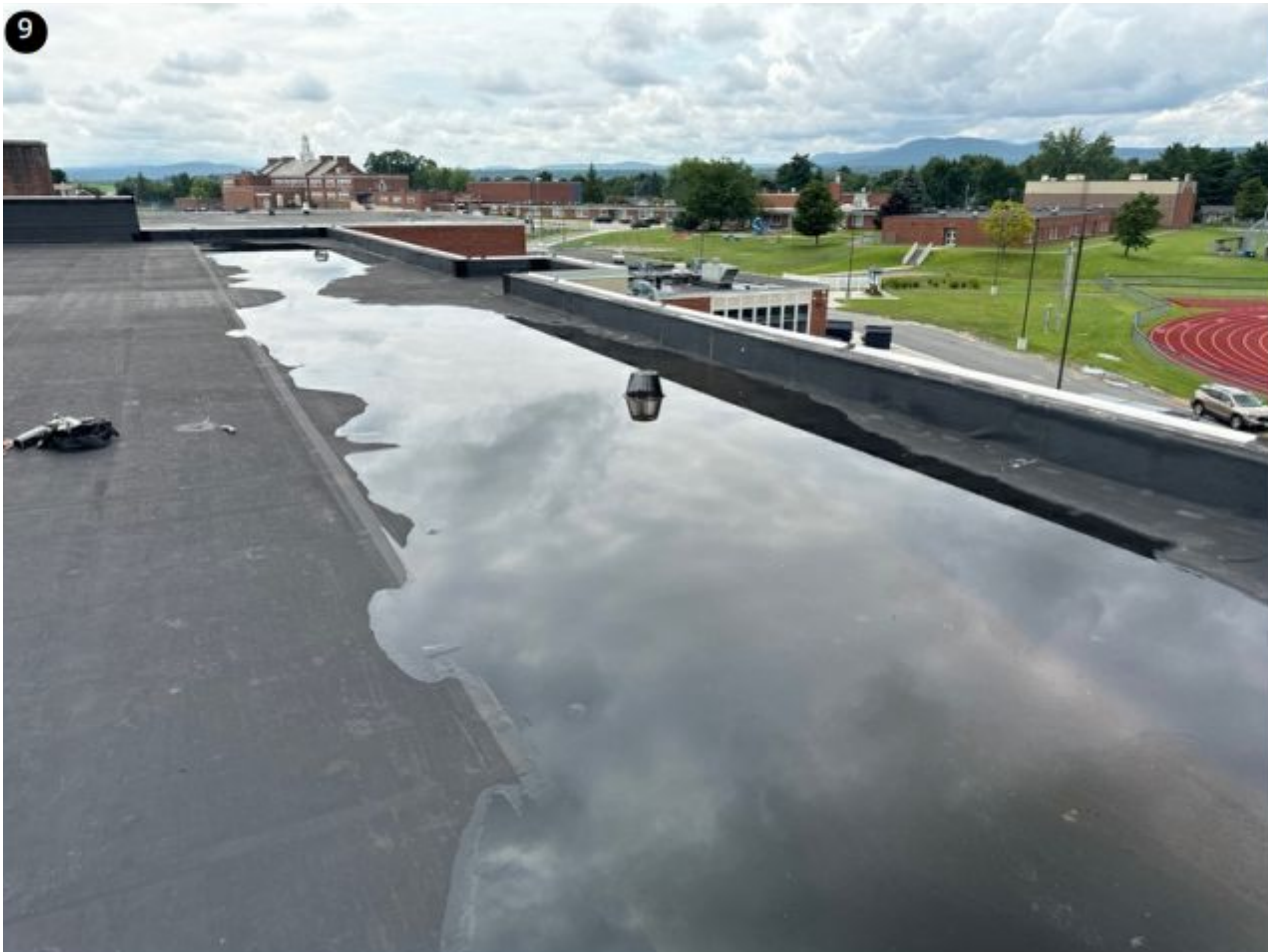
Ponding water holding on the edges of the roof