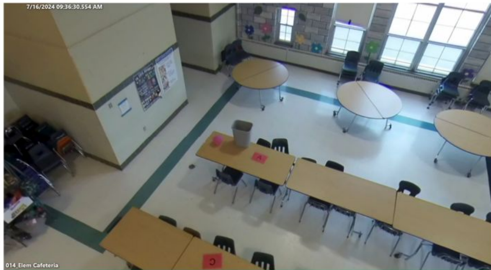
Elementary Café water leak