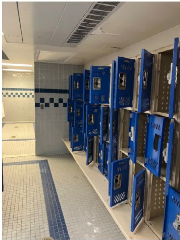
HS Roof 13 – Boys Locker room